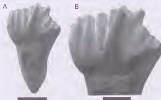
FIG 2. A. QMF52774, hypsilophodontid tooth in labial profile (scale bar = 2mm). B. Close up of tooth crown showing posterior ware facet (scale bar = 1mm).

margin of tooth crown curved, terminates at root, forming a distinctive neck. Posterior tip of primary ridge broken and worn. Posterior to primary ridge, four heavily faceted secondary ridges, extending from crown base to form distinct cuspsules. First cuspsule posterior of primary ridge largest and heavily worn below tip. Remaining posterior cuspsules smaller posteriorly, all heavily worn. Posterior margin of tooth crown angulate and terminates above the line of the anterior margin.